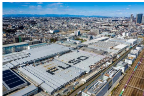
Kawasaki Plant/ Research & Development and Purchasing Center Kawasaki City, Kanagawa

The headquarters of Mitsubishi Fuso Truck & Bus Corporation is located in the Shin-Kawasaki Mitsui Building, within walking distance from the Kawasaki plant.