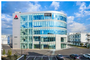
Headquarters Kawasaki City, Kanagawa

The headquarters of Mitsubishi Fuso Truck & Bus Corporation is located in the Shin-Kawasaki Mitsui Building, within walking distance from the Kawasaki plant.