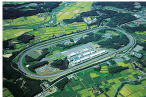
Kitsuregawa Proving Ground Sakura City, Tochigi

The Kawasaki plant is the largest FUSO truck plant, manufacturing light, medium and heavy duty trucks for Japan and export markets. It also includes the R&D center and the global Hybrid center, as well as operational functions such as procurement, logistics and production planning.