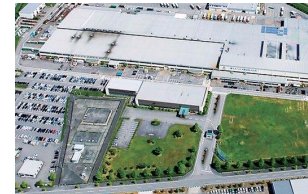
Mitsubishi Fuso Bus Manufacturing Co., Ltd. Toyama City, Toyama

The state-of-the-art plant near Chennai, opened in 2012, is also home to DICV's headquarters and R&D operations, and features a highly modern test track. It is the only Daimler plant worldwide to produce trucks, buses and engines for three brands—BharatBenz, FUSO, and MercedesBenz — for India and more than 30 export markets.