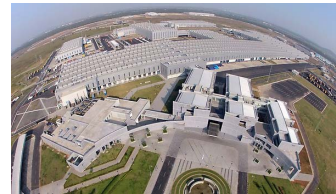
Daimler India Commercial Vehicles Pvt. Ltd. Chennai, Tamil Nadu

The FUSO proving ground two hours north of Tokyo is one of the largest commercial vehicle testing facilities in the world. With specialized equipment, procedures and staff for truck and bus testing, Kitsuregawa has been safeguarding the concept maturity and product quality of all FUSO vehicles since 1980.