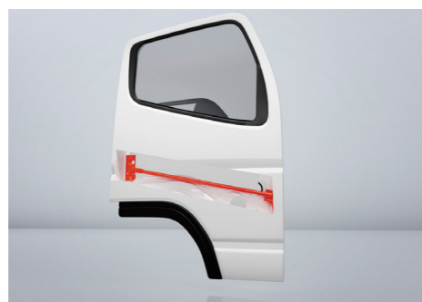
Side impact beams built into the doors strengthen door frame and rigidity to protect the driver and passengers.