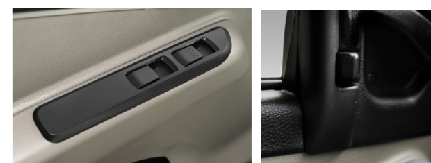
Power windows and central door lock