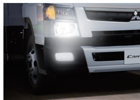
Bright, twin-bulb, adjustable halogen headlamps and fog lamps come standard for safer driving conditions.