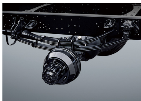
The high-performance suspension system delivers comfort and easy driving regardless of load condition.