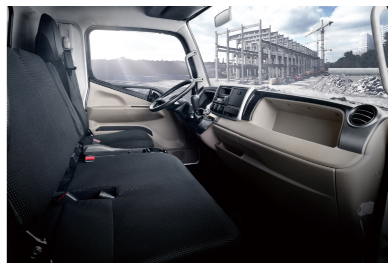
The cabin provides ample legroom, high roofing, and a wide range of adjustable settings such as reclinable seats and tilt-and-telescopic steering wheel allows the driver to easily find the most optimum driving position.