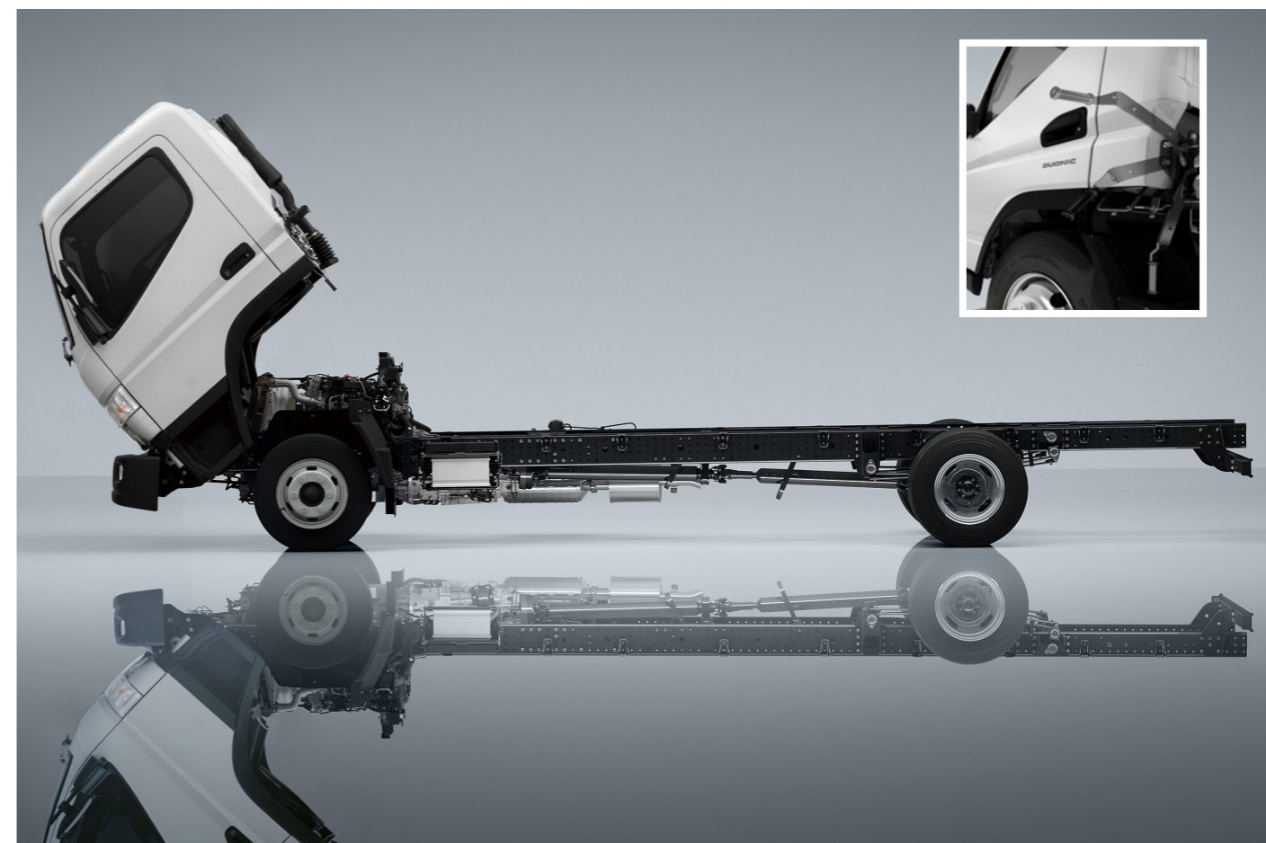
The cab tilt feature's larger angle ensures unrestricted access to the engine bay for easy inspection and maintenance.