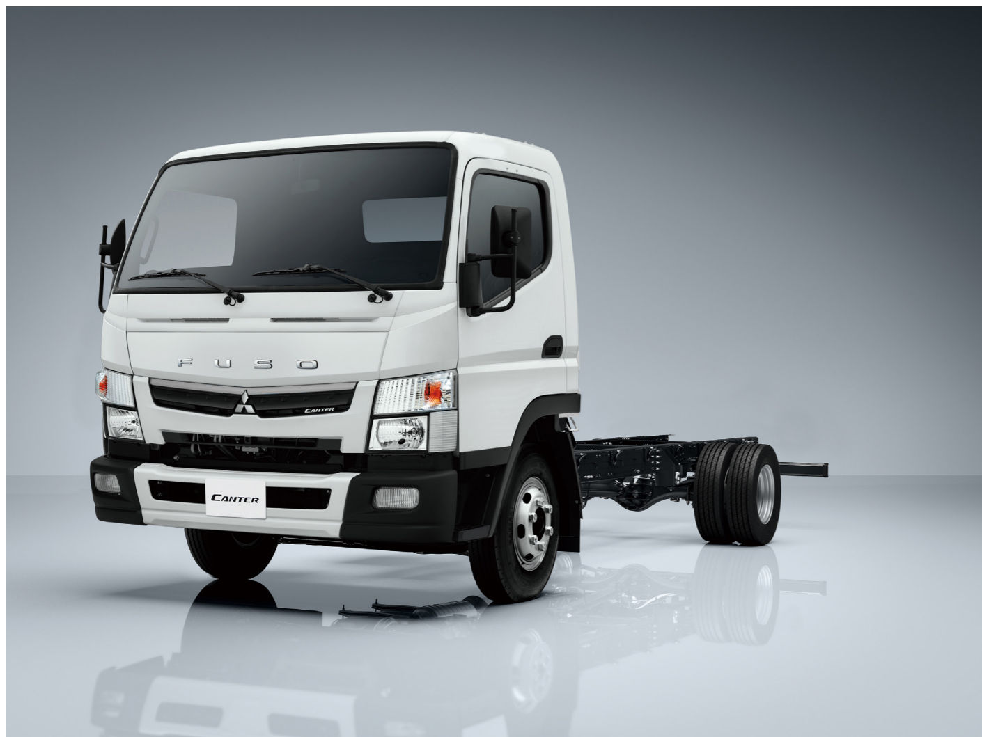
The Fuso Canter's refined design combines the functional cabin's rugged strength and an optimum chassis frame design for better protection, longer service life, and excellent ride comfort.