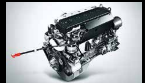
The direct injection diesel engine combines high output and flat torque for power hungry applications

The frame is shot-peened and powder coated to prevent corrosion and increase durability. Higher flange width and web height also offer stability and load bearing ability leading to longer frame life while the alligator type cross members make it exceptionally strong.