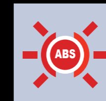
The Fuso FJ is equipped with Anti-Lock Braking System (ABS)