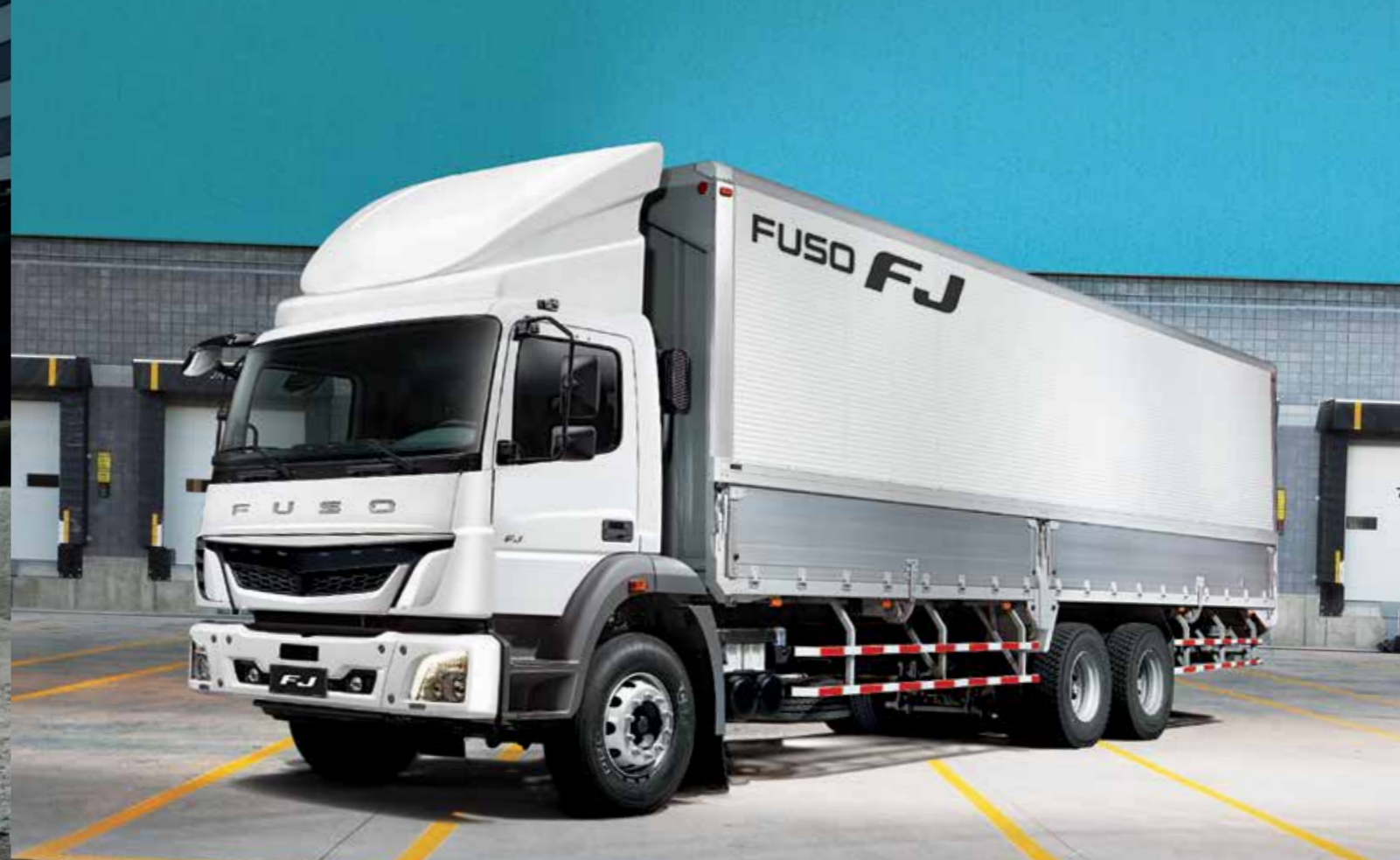
FJ 2528R • Natural 32 ft. Loading Span • Equipped with Flange type P.T.O. (Wing Van optional rear body)