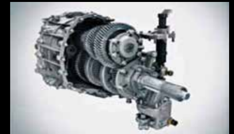
The Fuso FJ is equipped with a smooth-shifting 9-speed manual transmission which provides a higher flexibility of gear selection for various operating conditions thereby enhancing driving performance and improving fuel efficiency