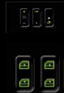
The cruise control further lends a fatigue-free drive while the power windows adds convenience