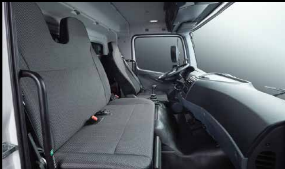
The multi-adjustable air pressure driver's seat and tilt and telescopic adjustable steering wheel allow the driver to set the optimum driving position.