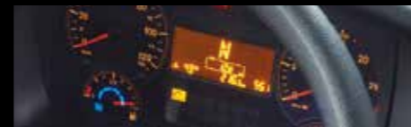
The intelligent meter cluster provides all the necessary information