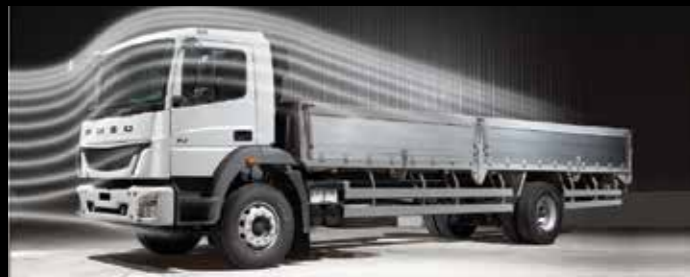
The FJ's aerodynamic cab design reduces wind resistance thus reducing cabin noise while increasing fuel efficiency