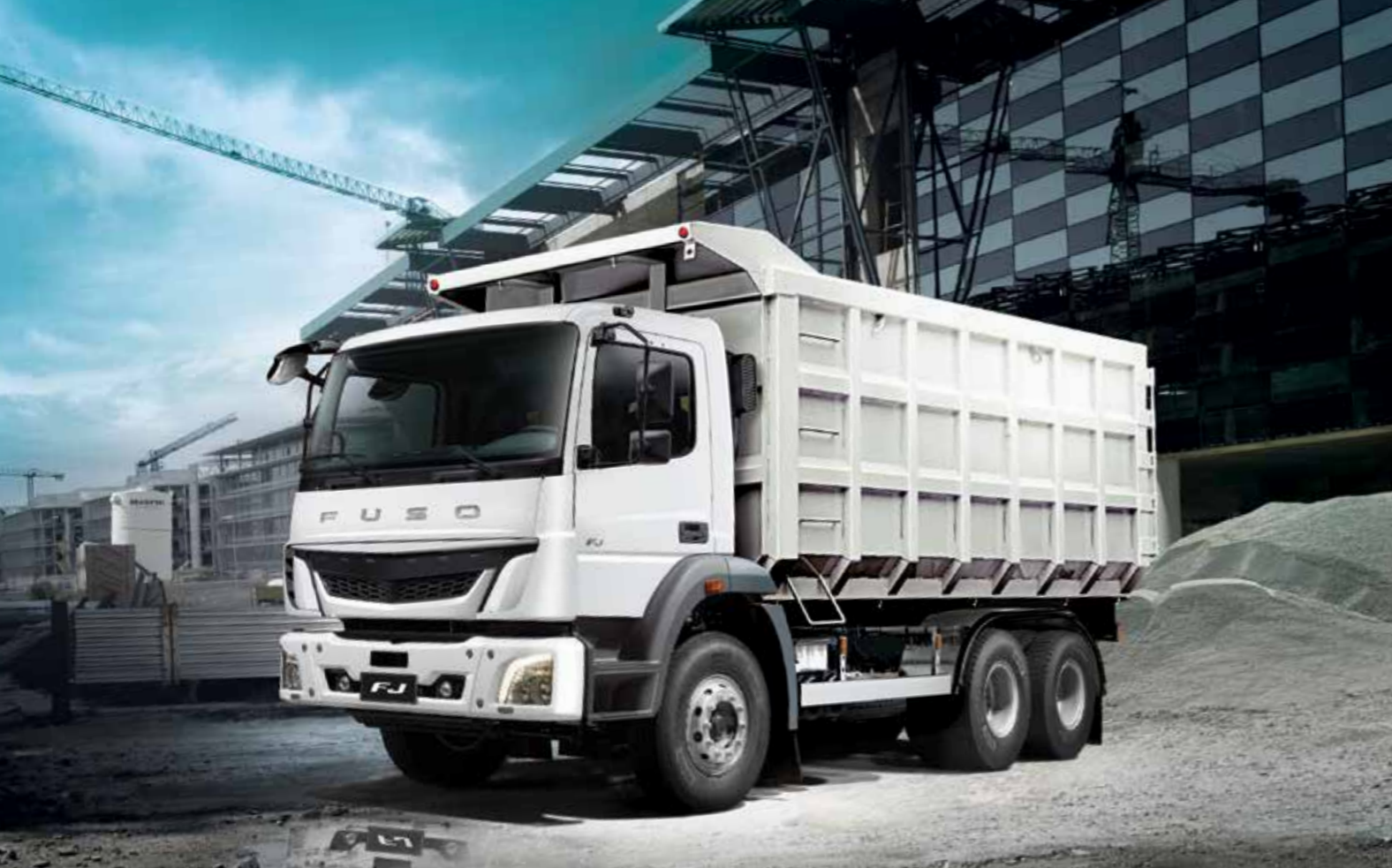
FJ 2528C • Short wheelbase • 8.1m Min. Turning Radius • Equipped with Spline type P.T.O. (Dump optional rear body)