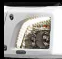
Daytime Running Lights (DRL)